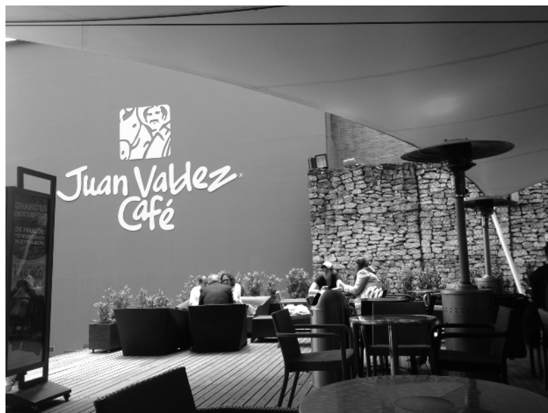
The Juan Valdez Café, Bogota, Colombia.

"No." The barista behind the counter shakes her head, which is topped with a maroon hat that matches her maroon apron. She is holding the biggest cup of coffee they serve at the Juan Valdez Café in Bogota, Colombia—a cup that looks like it would barely hold a double shot of espresso. It's not even close to the size of a short coffee at Starbucks, which only holds eight ounces. And who drinks only eight ounces of coffee these days?